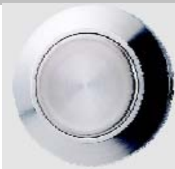
Stainless steel (Spiral surface)