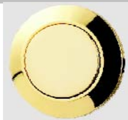
Gold - plated brass (Satin surface)