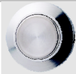
Stainless steel (Spiral surface)