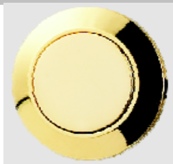
Gold - plated brass (Satin surface)