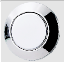
Nickel - plated brass (Satin surface)