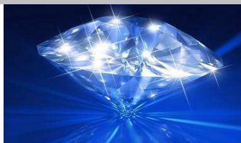
The Power of LED Light