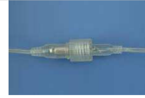
Protection Degree IP68 Type C2 Male and Female for two Wires Type C4 Male and Female for four Wires