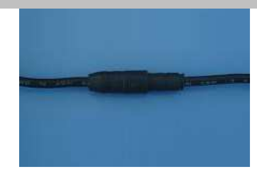
Protection Degree IP50 Type D2 Male and Female for two Wires