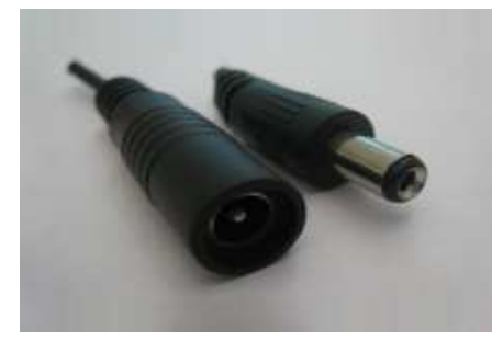
Protection Degree IP50 Type F2 Male and Female for two Wires