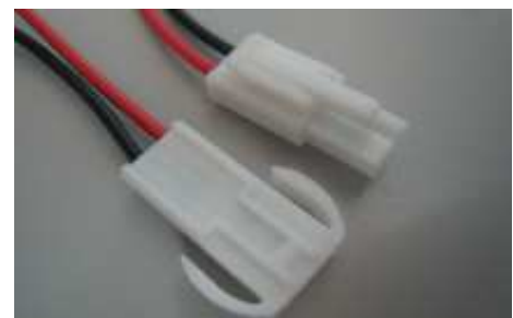
Protection Degree IP20 Type G2 Male and Female for two Wires