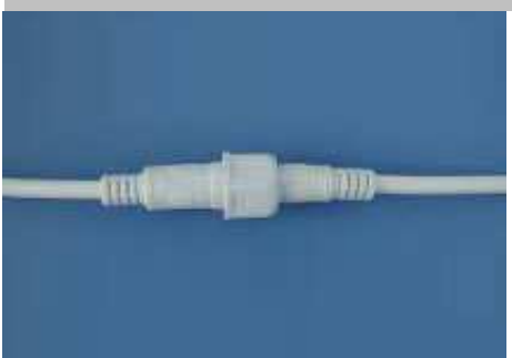
Protection Degree IP68 Male and Female for two Wires