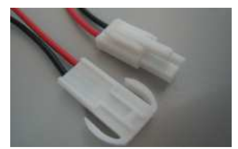
Protection Degree IP20 Type G2 Male and Female for two Wires