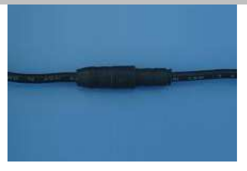
Protection Degree IP50 Type D2 Male and Female for two Wires