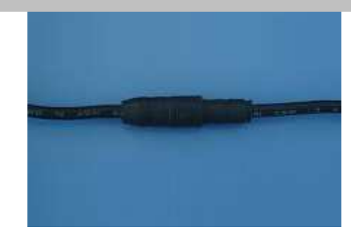
Protection Degree IP50 Type D2 Male and Female for two Wires