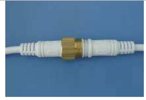
Protection Degree IP68 Type B2 Male and Female for two Wires Type B4 Male and Female for four Wires