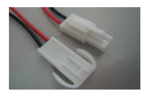
Protection Degree IP20 Type G2 Male and Female for two Wires