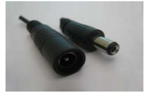
Protection Degree IP50 Type F2 Male and Female for two Wires