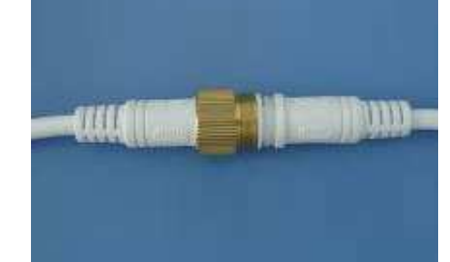
Protection Degree IP68 Type B2 Male and Female for two Wires Type B4 Male and Female for four Wires