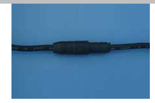
Protection Degree IP50 Type D2 Male and Female for two Wires