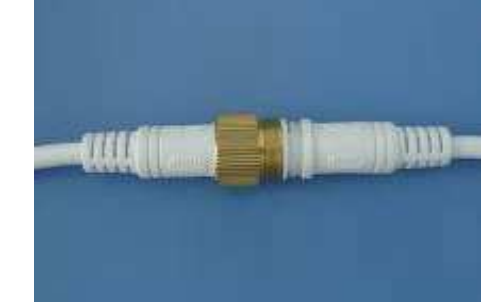
Protection Degree IP68 Type B2 Male and Female for two Wires Type B4 Male and Female for four Wires