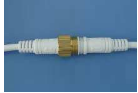
Protection Degree IP68 Type B2 Male and Female for two Wires Type B4 Male and Female for four Wires