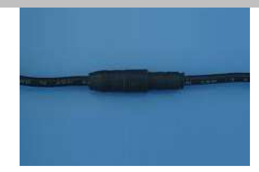
Protection Degree IP50 Type D2 Male and Female for two Wires