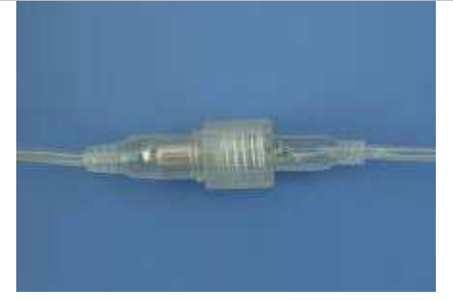
Protection Degree IP68 Type C2 Male and Female for two Wires Type C4 Male and Female for four Wires