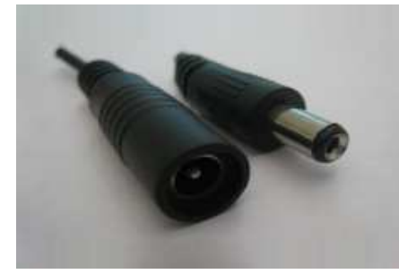
Protection Degree IP50 Type F2 Male and Female for two Wires