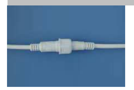
Protection Degree IP68 Type A2 Male and Female for two Wires Type A4 Male and Female for four Wires