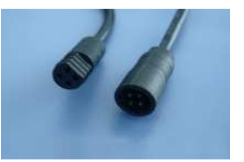
Protection Degree IP50 Type E4 Male and Female for four Wires