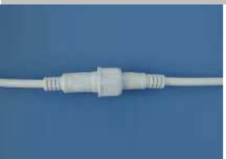
Protection Degree IP68 Type A2 Male and Female for two Wires Type A4 Male and Female for four Wires