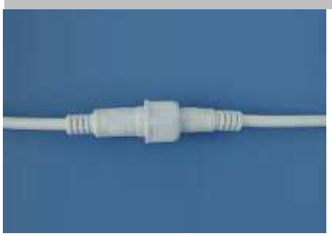
Protection Degree IP68 Type A2 Male and Female for two Wires Type A4 Male and Female for four Wires