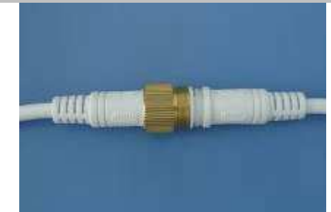
Protection Degree IP68 Type B2 Male and Female for two Wires Type B4 Male and Female for four Wires