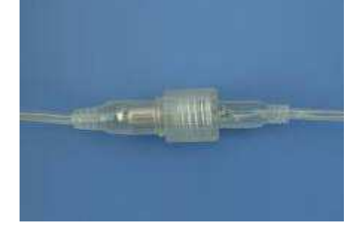
Protection Degree IP68 Type C2 Male and Female for two Wires Type C4 Male and Female for four Wires