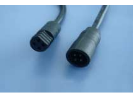
Protection Degree IP50 Type E4 Male and Female for four Wires