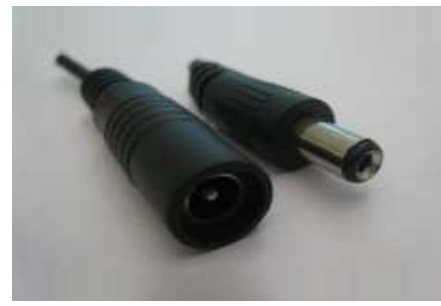
Protection Degree IP50 Type F2 Male and Female for two Wires