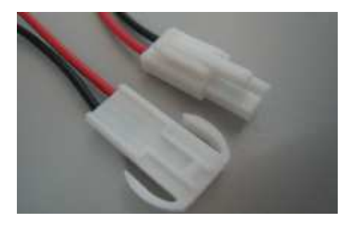
Protection Degree IP20 Type G2 Male and Female for two Wires