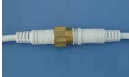
Protection Degree IP68 Male and Female for two Wires Type B4 Male and Female for four Wires