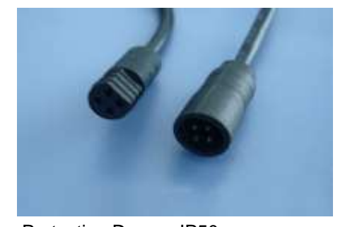
Protection Degree IP50 Type E4 Male and Female for four Wires