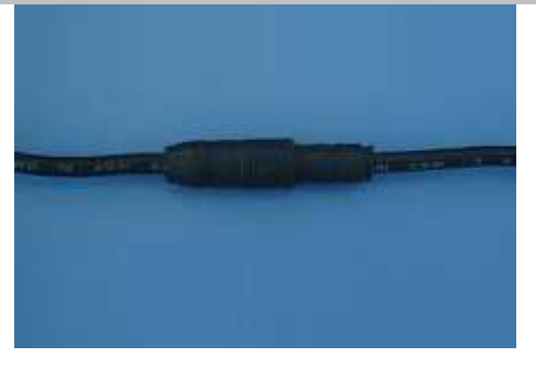
Protection Degree IP50 Type D2 Male and Female for two Wires