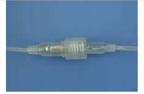
Protection Degree IP68 Type C2 Male and Female for two Wires Type C4 Male and Female for four Wires