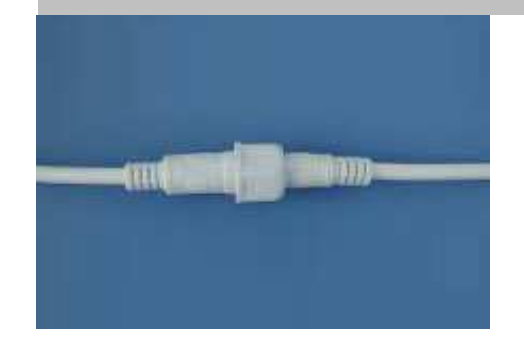
Protection Degree IP68 Type A2 Male and Female for two Wires Type A4 Male and Female for four Wires