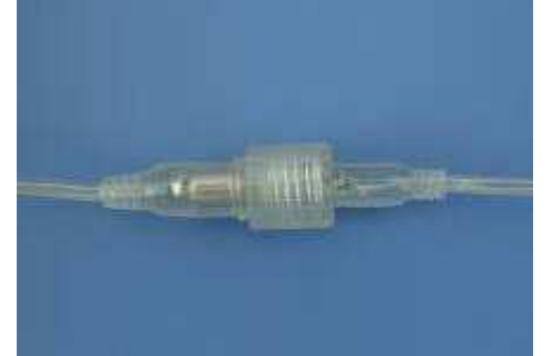
Protection Degree IP68 Type C2 Male and Female for two Wires Type C4 Male and Female for four Wires