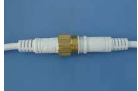
Protection Degree IP68 Type B2 Male and Female for two Wires Type B4 Male and Female for four Wires