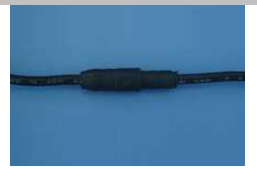
Protection Degree IP50 Type D2 Male and Female for two Wires