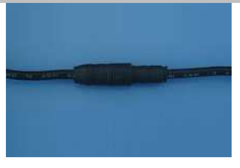
Protection Degree IP50 Type D2 Male and Female for two Wires