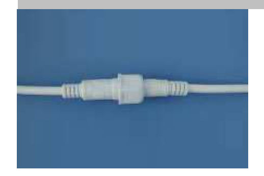
Protection Degree IP68 Type A2 Male and Female for two Wires Type A4 Male and Female for four Wires