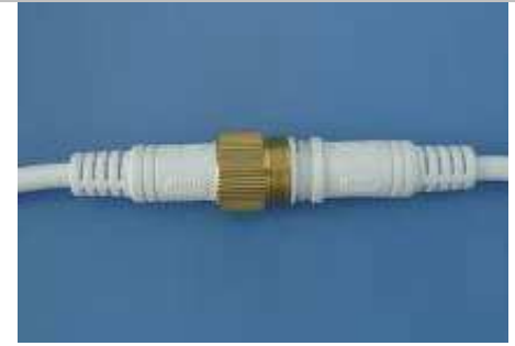
Protection Degree IP68 Type B2 Male and Female for two Wires Type B4 Male and Female for four Wires