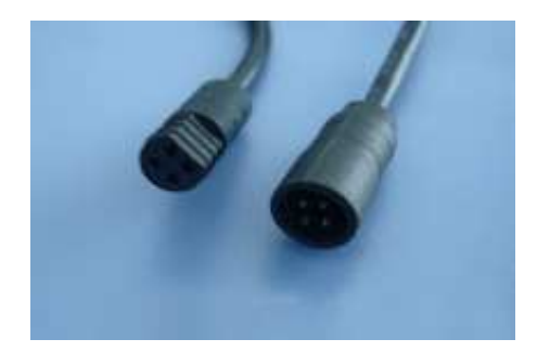
Protection Degree IP50 Type E4 Male and Female for four Wires