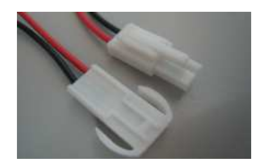
Protection Degree IP20 Type G2 Male and Female for two Wires