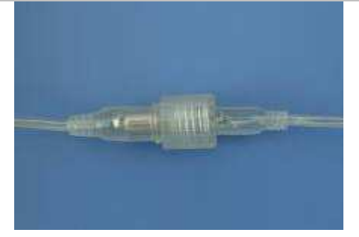
Protection Degree IP68 Type C2 Male and Female for two Wires Type C4 Male and Female for four Wires