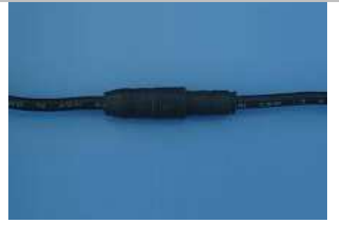
Protection Degree IP50 Type D2 Male and Female for two Wires