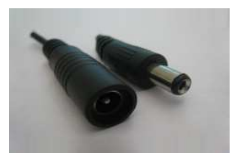
Protection Degree IP50 Type F2 Male and Female for two Wires