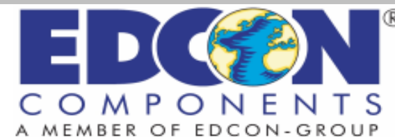
Connected Terminals Cematic