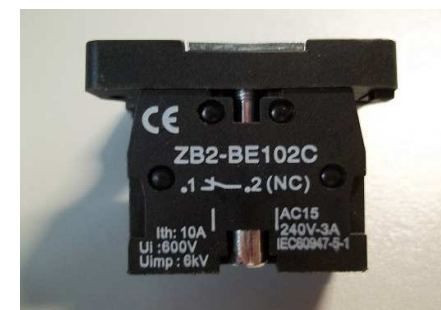
Contact Type 1N/C 1/2