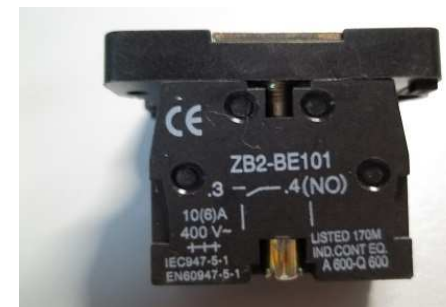
Contact Type 1N/O 3/4

Industrial Rotary Push Switch Type 1 Long Handle