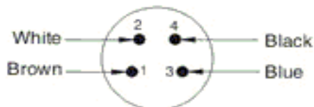
View from front