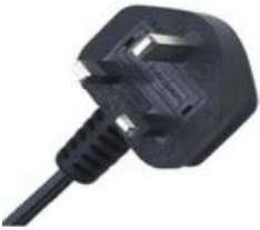
Order Code Table Connector Side 1