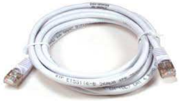
Plug Type A Short Body